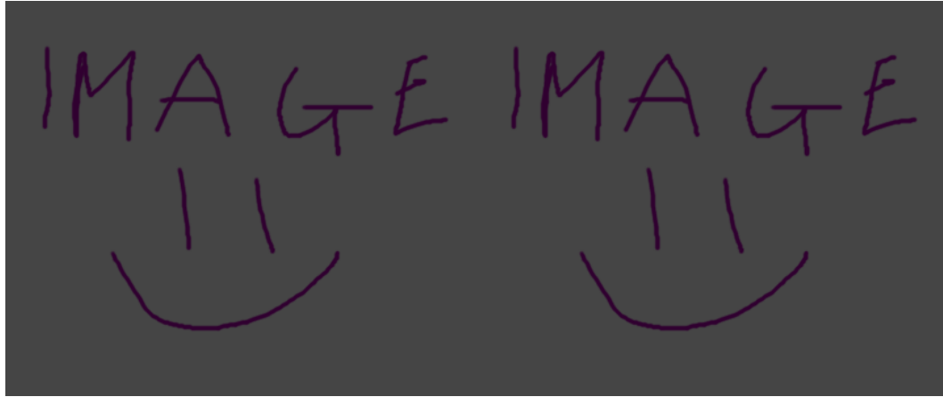
(a) Case 1.