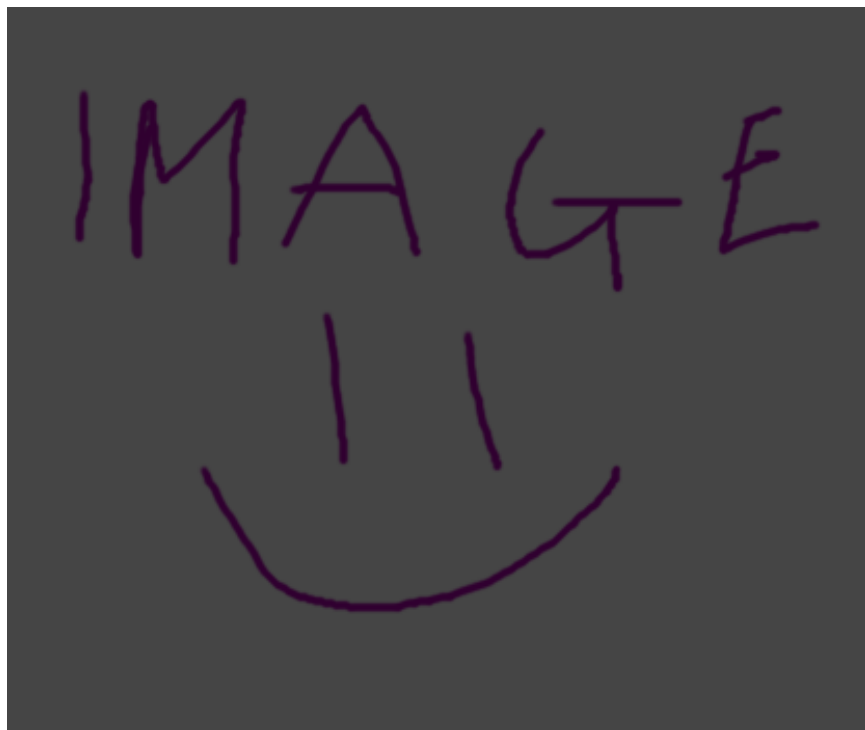
Figure 1: Example image.