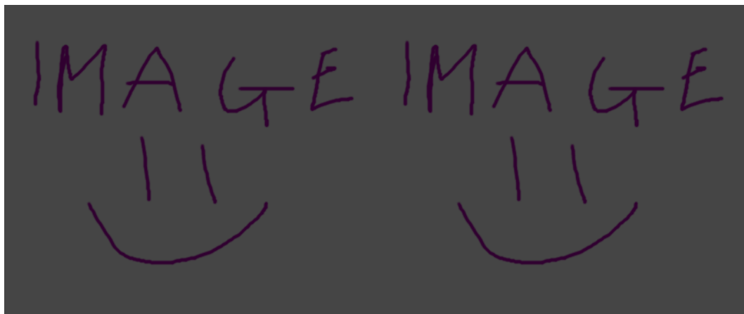
(e) Case 5.